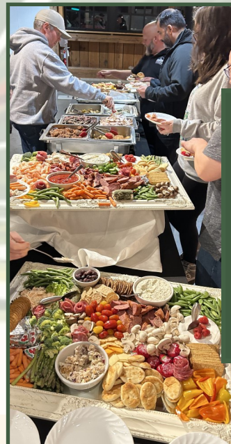
It was a delicious 2024 CUPE 454 Social at the Harris Barn

Holiday Closure The CUPE 454 Office will be closed Monday, December 23, 2024 to Friday, January 3, 2025