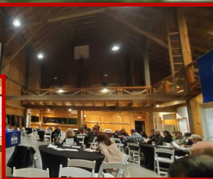
CUPE 454 December Membership Meeting and Social at the Harris Barn